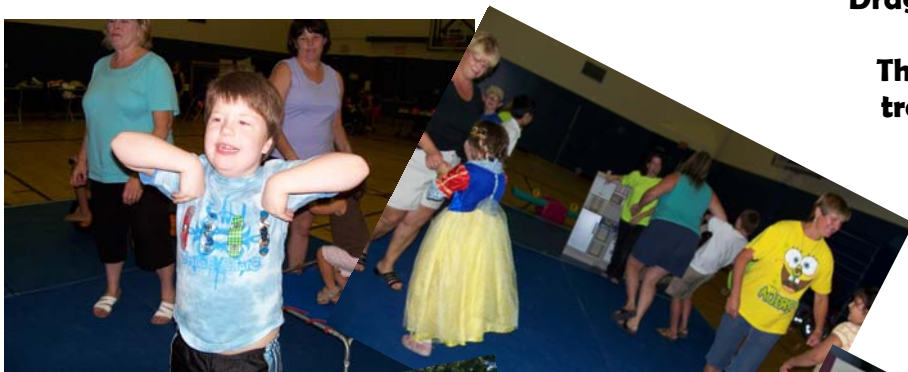
Fun with the Chicken Dance